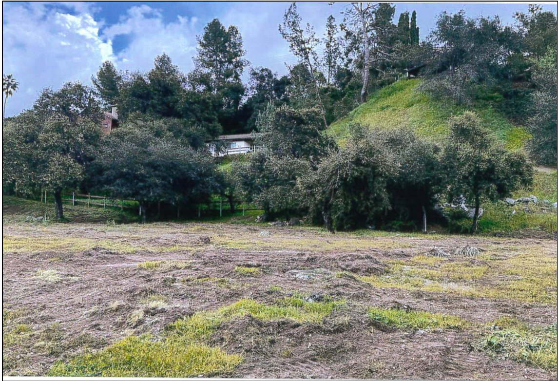
10. View looking South toward adjacent properties; 445 and 505 W. Gladstone Street.