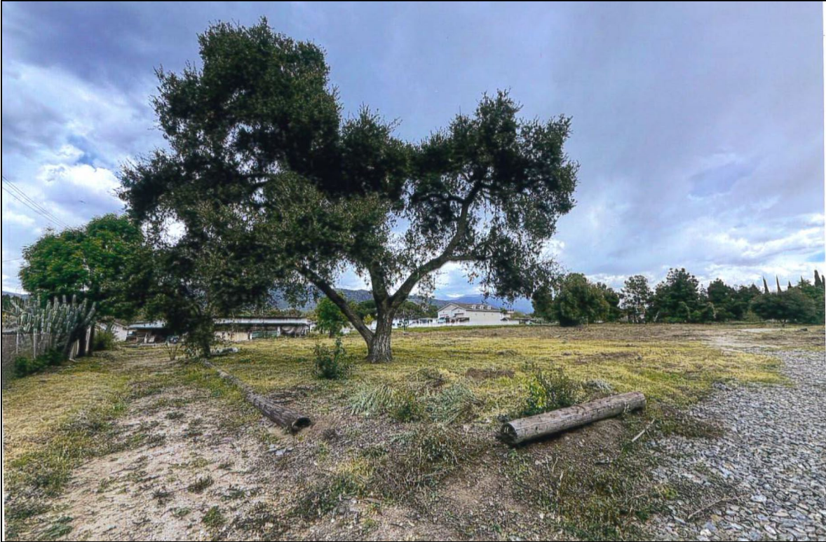
2. View of existing Oak tree to be preserved on Lot 1.