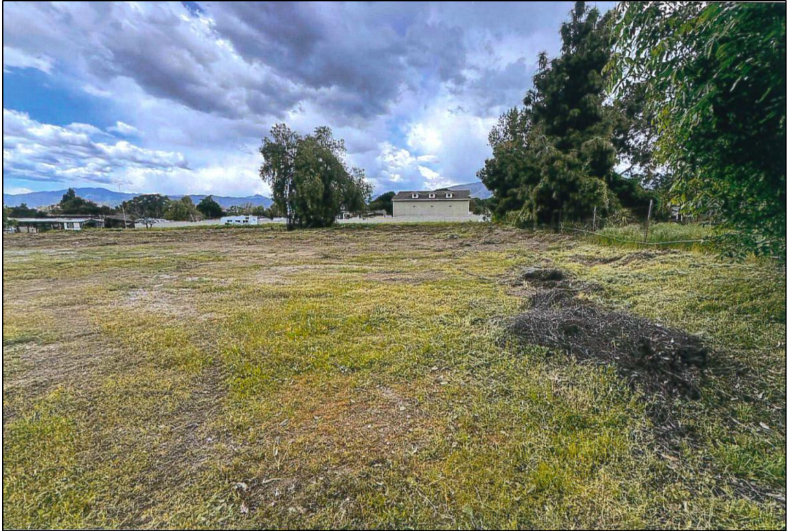
8. View looking North from proposed Lot 3 with view of detached garage of adjacent property 744 N. Oakway Avenue.