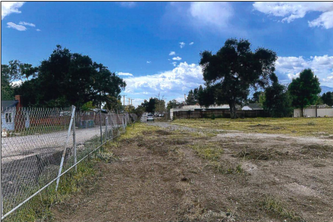
3. View looking West toward Oakway Avenue/Ghent Street.