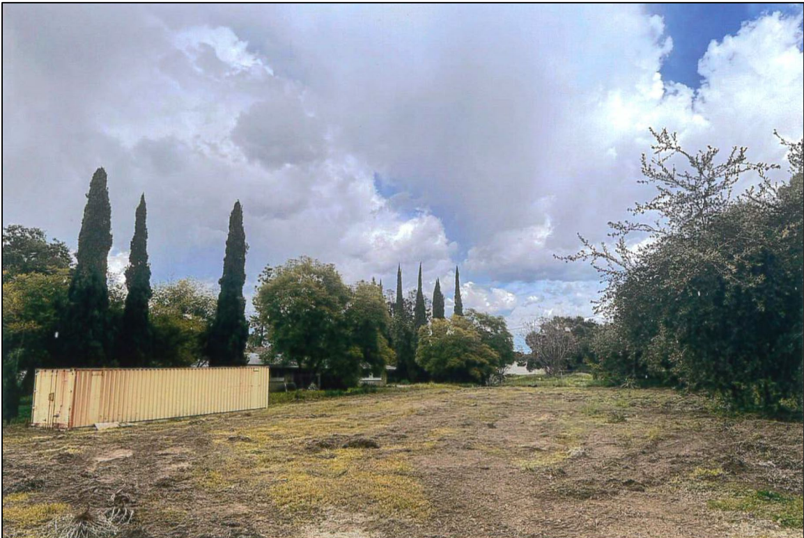
9. View looking northeast from west property line of proposed Lot 4.